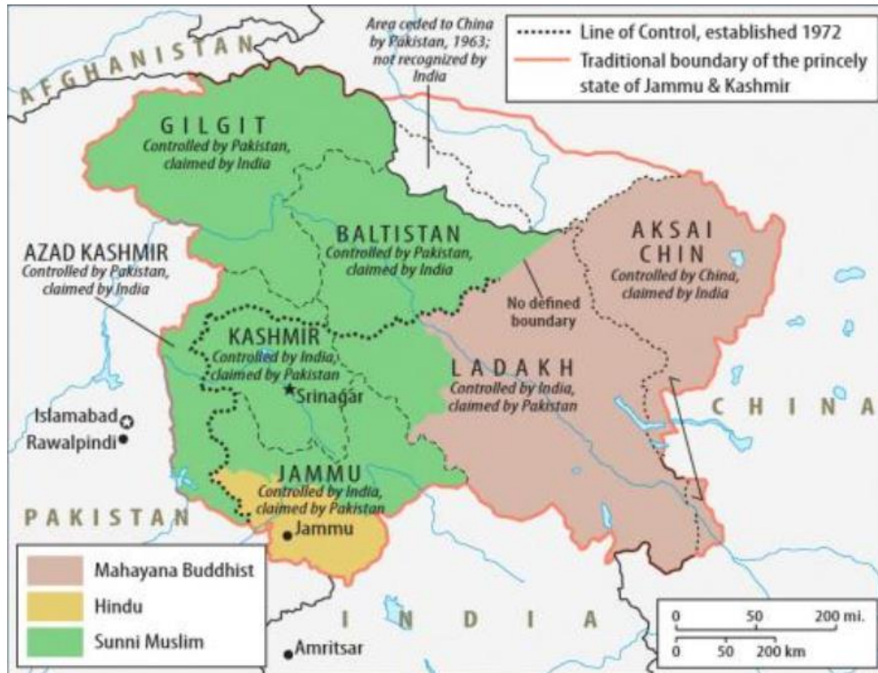
Figure 1: Current Political boundaries of Kashmir. (Hobbs, 2008, pp.314)

Despite the standing ceasefire, "both sides accuse the other of violating the cease-fire and claim to be shooting in response to the attacks. An uptick in border skirmishes that began in late 2016 and continued into 2018 killed dozens and displaced thousands of civilians on both sides of the Line of Control." (Global Conflict Tracker, 2019, p. 3) Moreover, the situation continues to rapidly worsen with the election of a Hindu-majoritarian government in India. With attempts to favor the Hindu population in India through political and economic policy changes such as demonetization, the secular status of India continues to be compromised. If things progress at the same pace, soon the motive of the conflict will yet again be reduced and limited to the differences based on religious ideologies.