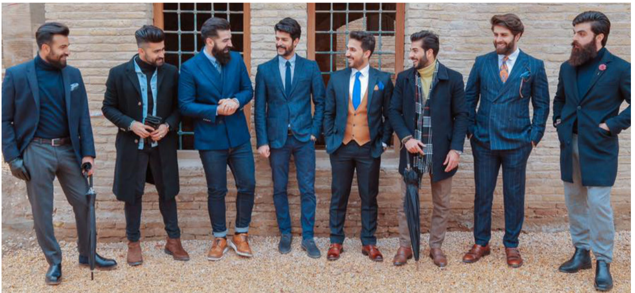
A TASTE OF KURDISH STYLE